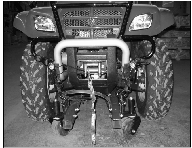
Front View of Caster Wheels when installed to the Interframe.